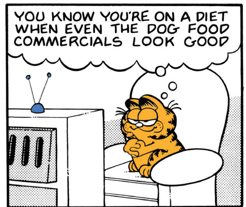
GARFIELD © 1982 Paws, Inc. Reprinted with permission of ANDREWS MCMEEL SYNDICATION. All rights reserved.